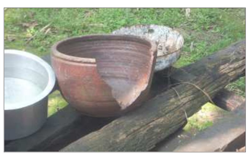
A washing basin is purposefully destroyed by Burmese troops during conflict with a Karen armed group.

Everyone knows that apart from ordinary villagers, my husband did not befriend anyone [any ethnic armed group]. He did not even have contact with any armed groups. So, why did the Burmese troops kill him? That's not fair. They are the ones who went into the battle but now the person who got killed is my husband. They are the persons who should get killed: not my husband. Now, I have my three kids and have no skills to work. Now, I do not know what to do as I can not afford sending my three kids to school and there is no rice left at home to cook.