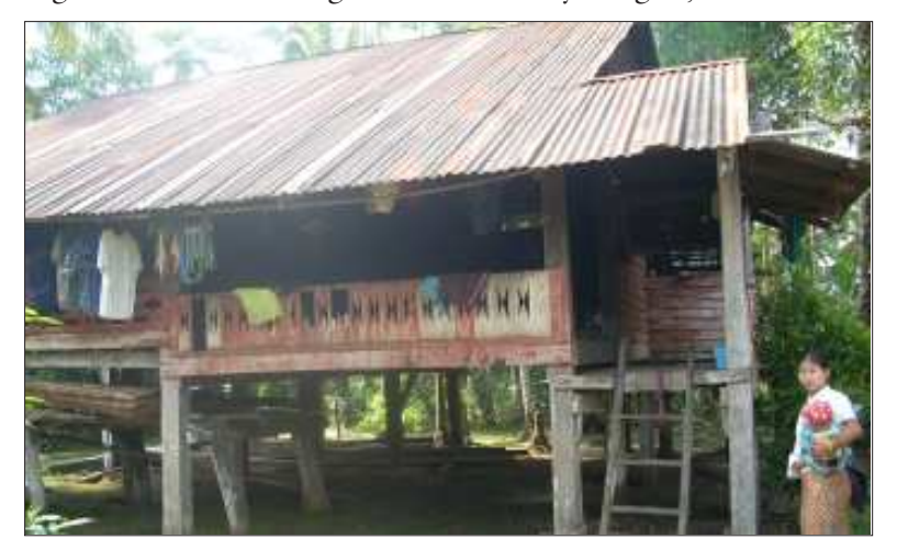
A local's home is destroyed by Burmese troops from LIB Nos. 562 and 563 during conflict with a Karen armed group.

knew anything about the fighting. When we were on our way to Dauk Phalan village, suddenly a group of Burmese troops surrounded and tried to arrest us. As it happened immediately, I tried to escape, but because they surrounded me, I could not run away and I was arrested. I was very frightened when I looked at their faces. But, it was hard to interact with them using my legs and hands [trying to sign using body language]. Then, they made me kneel down on the ground, and three soldiers kicked my back and head with their soldier's boots several times. Having kicked me for five minutes, their leader said to stop [kicking me], and at the time, I noticed my head had begun to bleed. In the beginning it was very