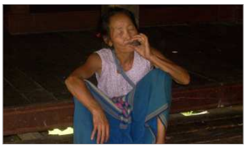
A local woman whose house was shot multiple times by Burmese troops.

That time also we [had to] collect money from each household in our village and pay as they demanded. It is also possible that the Burmese army overcharged villagers from other villages for money, but we do not know about that because we have not been informed. Yet, if we had known about that [other villagers were demanded to pay], we could not help them give money. This is because we have to struggle for our daily meals while the situation in the region is unstable.